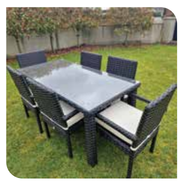
SETTE RATTAN DINING SET 7 PIECE