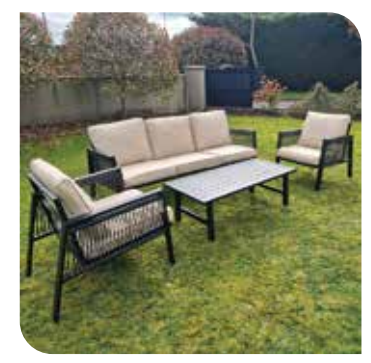
SEOMRA LOUNGE SET DELUXE RANGE 4 PIECE Only €999 was €1998