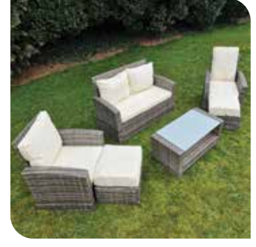
AMORE 6 PIECE RATTAN SOFA SET