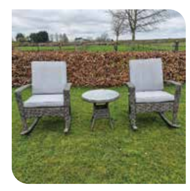
ORCHID ROCKING CHAIR 3 PIECE SET