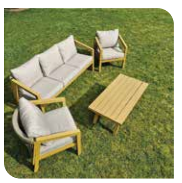
SORRISO LOUNGE SET DELUXE RANGE 4 PIECE Only €1049 was €2098