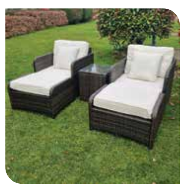
SIENNA COMFORT RATTAN SOFA SET BROWN