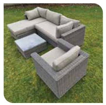
GLACIER RATTAN CORNER SOFA SET DELUXE RANGE