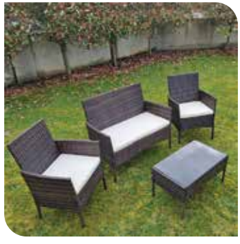
FLORENCE 4 PIECE RATTAN SOFA SET IN BROWN