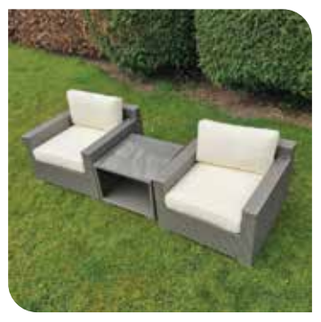
BLOSSOM COFFEE SET DELUXE RANGE 3 PIECE