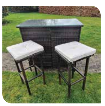
TOWNYARD COCKTAIL BAR SET