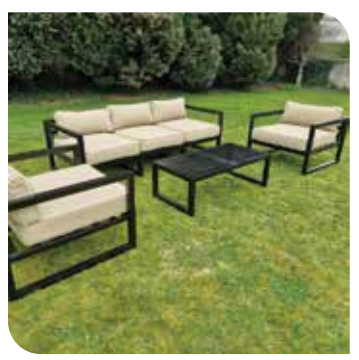
TORO LOUNGE SET DELUXE RANGE 4 PIECE

FLORENCE 4 PIECE RATTAN SOFA SET IN BLACK Only €199 was €299