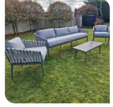
SIAM NEW ROPE 4 PIECE SET DELUXE RANGE