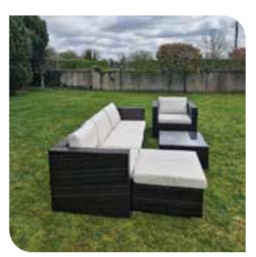
MIAMI X RATTAN CORNER SOFA SET